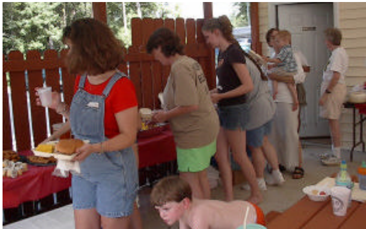
The food arrives on time— well almost.