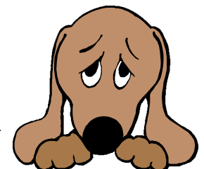
Does this mean I can't bite a commissioner?

Critics of the change see it as vague, hard to enforce and subject to abuse by disgruntled neighbors.