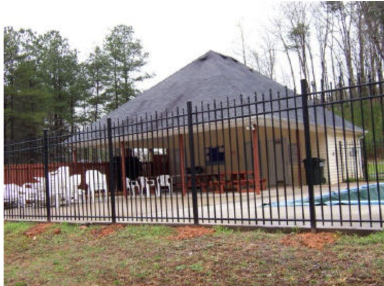
Here's how the new fence construction looked on Thursday with three sides completed.