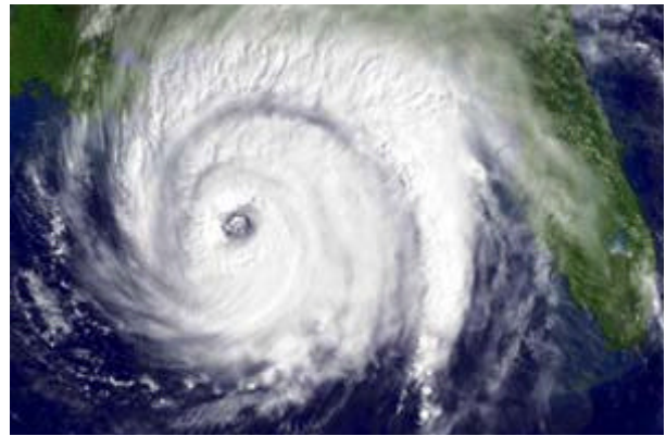
Hurricane Ivan on Sept. 15, 2004, before slamming into the Gulf Coast. Resulting heavy rains caused runoff damage in the Atlanta area including damage to Waverly Park's walking trail.

Keep track of tropical weather that may impact the Atlanta area at the National Hurricane Center's Tropical Prediction Center at www.nhc.noaa.gov